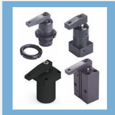
Pneumatic Swing Clamp