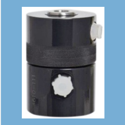
Hydraulic Hollow Piston Cylinder