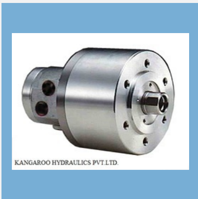
Hydraulic Rotary Cylinder