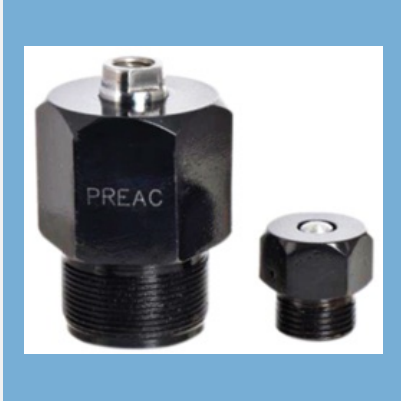
Hydraulic Manifold Cylinder