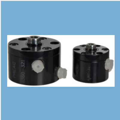
Hydraulic Compact Cylinders