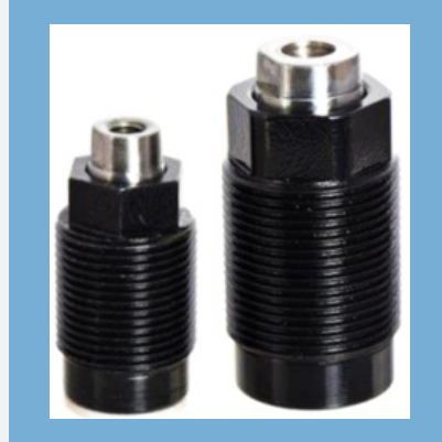
Hydraulic Mini Threaded Cylinders