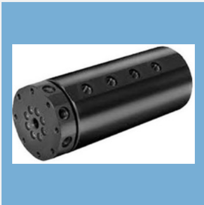
Hydraulic Rotary Couplings