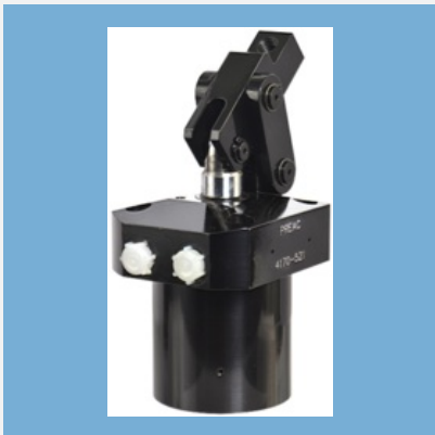
Vertical Swing Cylinders