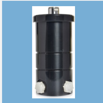
Hydraulic Universal Clamping Cylinder