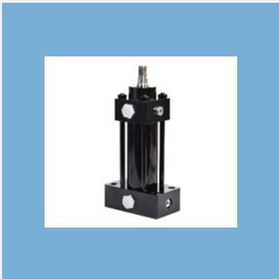
Tie Rod Hydraulic Cylinder