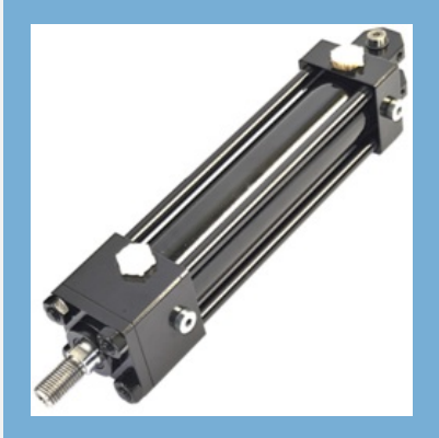
Tie-Rod Hydraulic Cylinder