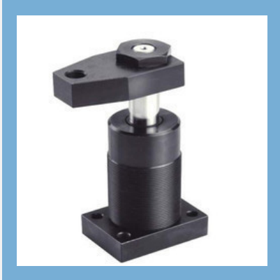
Hydraulic Clamp Cylinder