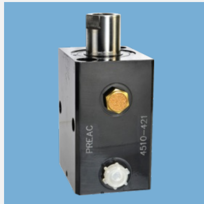
Hydraulic Work Support