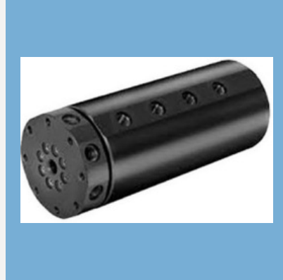
Hydraulic Rotary Couplings