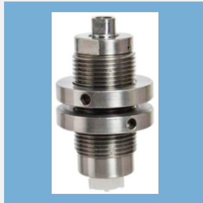
Hydraulic Threaded Body Cylinder