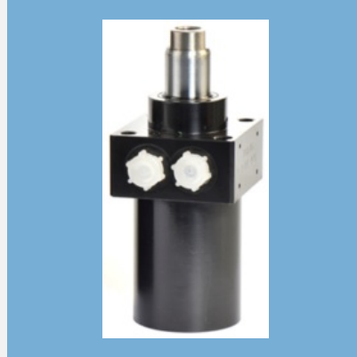
Hydraulic Pull Cylinder