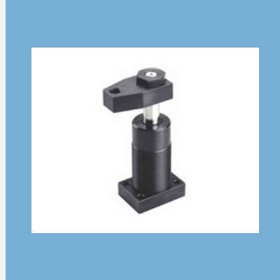
Hydraulic Swing Clamp