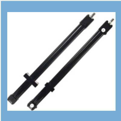
Hydraulic Counterbalance Cylinders