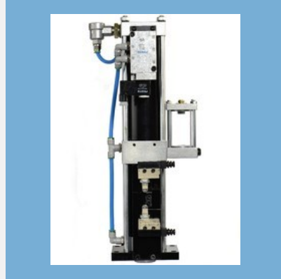
Tool De-Clamp Cylinder