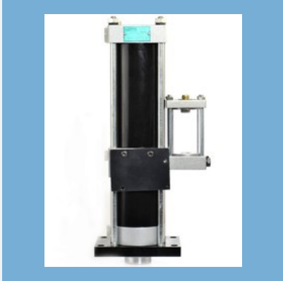
Tool De-Clamp Cylinder