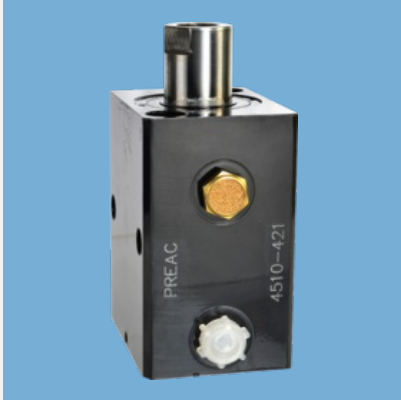
Hydraulic Work Support