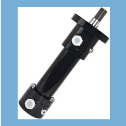
Bolted Hydraulic Cylinder