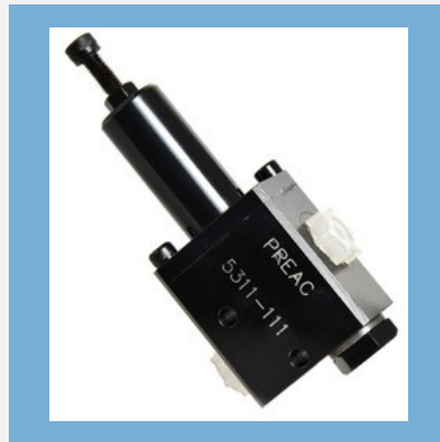
Hydraulic Sequence Valve