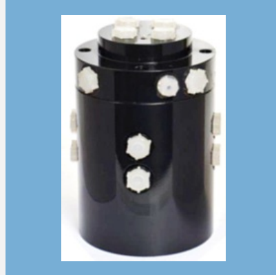
Hydraulic Rotary Valve