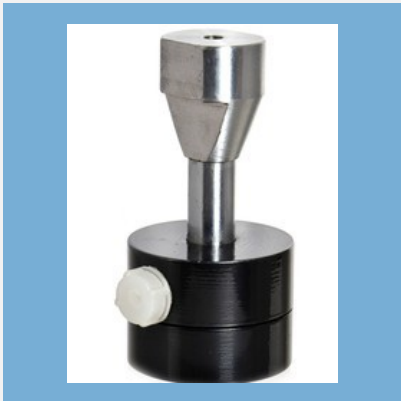
Die Clamping Cylinder