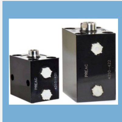
Hydraulic Block Cylinder