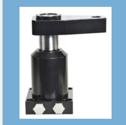
Hydraulic Swing Cylinder