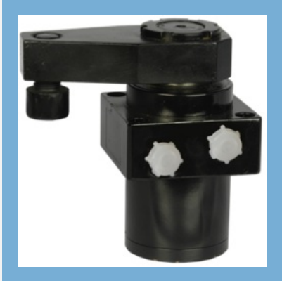
Hydraulic Swing Cylinder