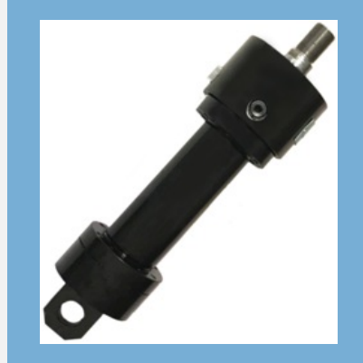
Bolted Hydraulic Cylinder