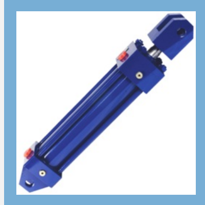
Tie-Rod Hydraulic Cylinder