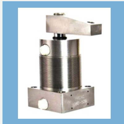
Pneumatic Swing Cylinder