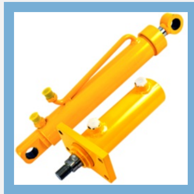
Welded Hydraulic Cylinders